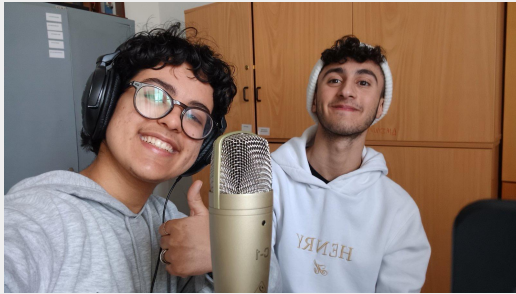
Had an interview in our schools radio station